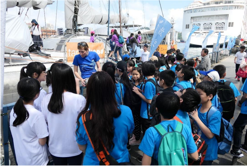
Caption: Student groups boarding the ship (photographed by the Taiwan Marine Education Center)

Caption: Crew leading students to visit TARA, and explaining to them how to give guided tours (photographed by the Taiwan Marine Education Center)