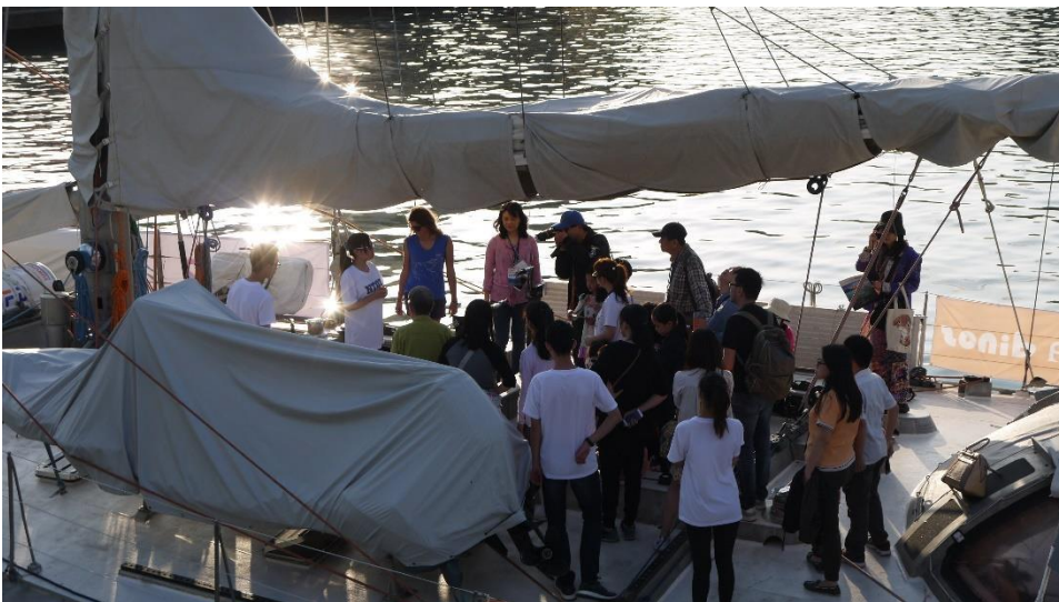
Caption: NTOU students giving guided tour to the public